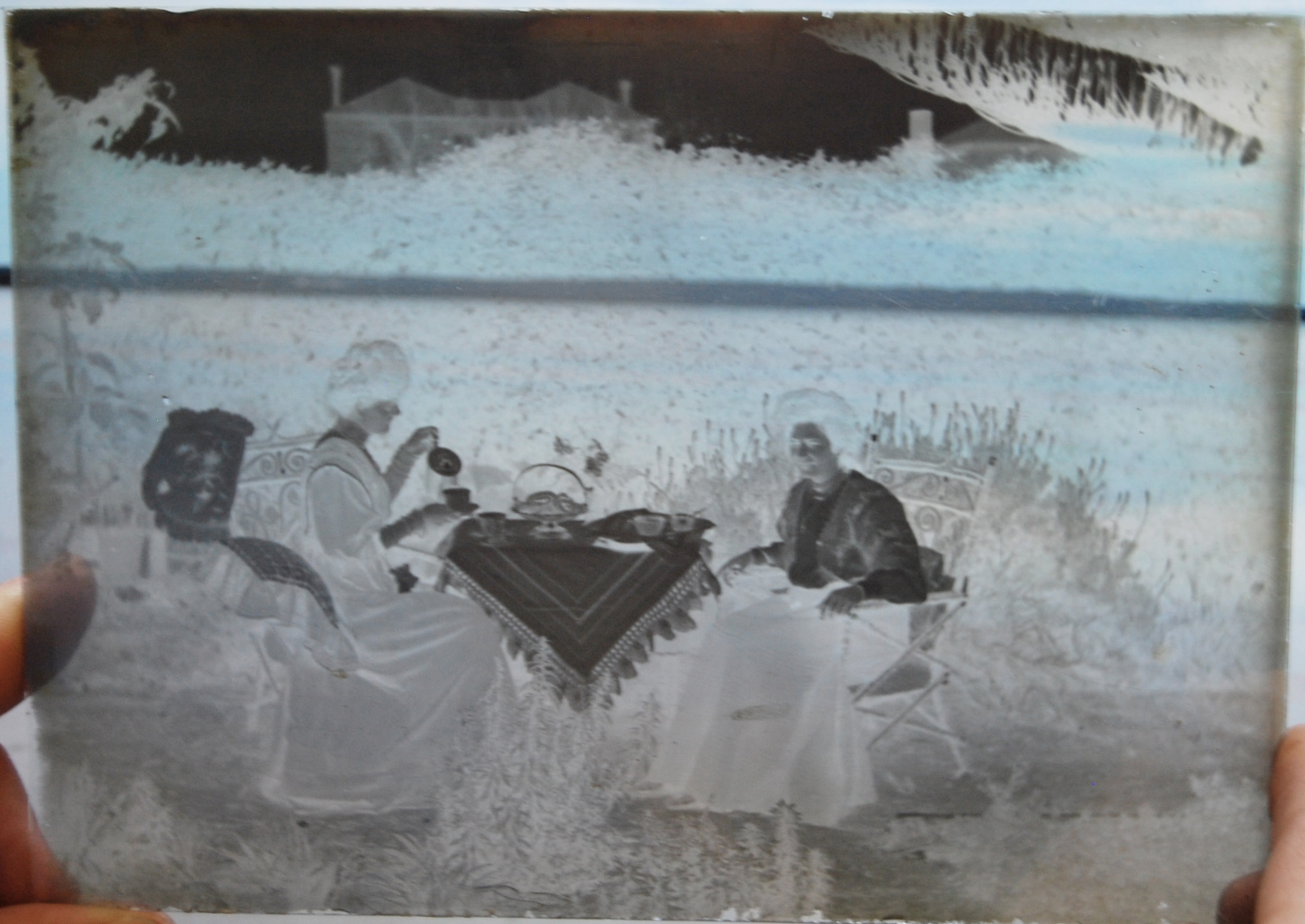
Image courtesy the artists (glass negative by Len Daw, with thanks to the Daw family & Neville Mulgat).